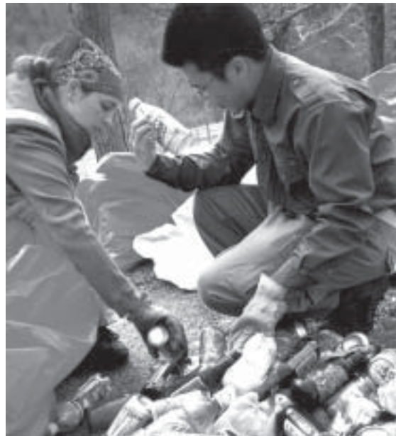
An expanded bottle bill would include many of the beverage containers routinely picked up by participants in Scenic Hudson's annual Great River Sweep anti-litter campaign.

source of money for new environmental spending. According to advocates who are pushing for reform of the state's 22-year old returnable container law, expansion of the program would not only help alleviate New York's litter and solid waste problems, but would also generate millions of dollars of additional revenue by capturing unredeemed beverage container deposits for the EPF. Not only is it increasingly apparent that expanding New York's most successful solid waste program makes sense but, for the first time, there is solid evidence of broad public support for this reform.